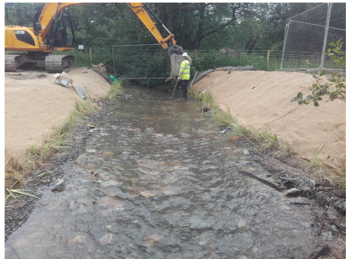
Erosion control coir matting, Rock Rolls and preplanted Coir Rolls in place and the river reinstated