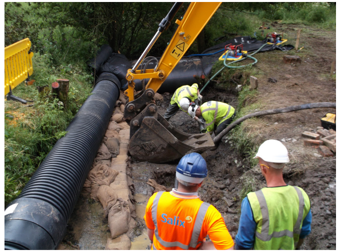
The river was safely dewatered whilst the pipe was moved

The methodology used meant that the situation was dealt with quickly, in a manner which was approved by the regulator and which will future proof the pipe from being exposed in the same manner.