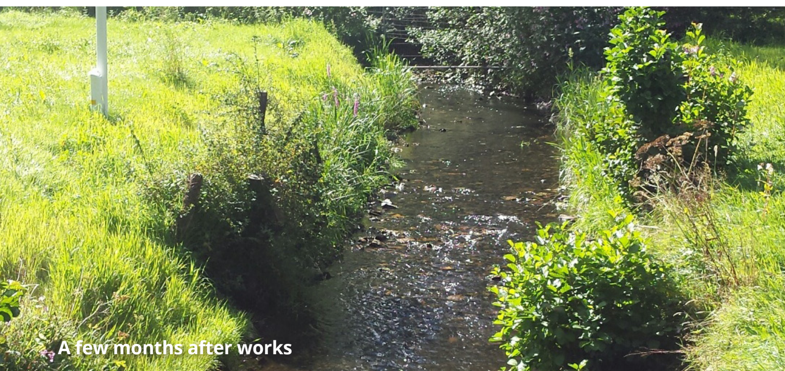
A few months after works